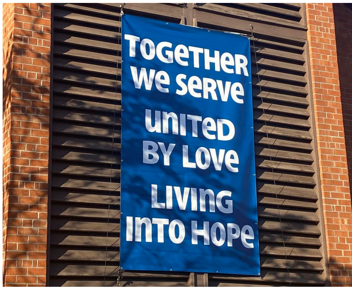
Black Mountain Presbyterian Church