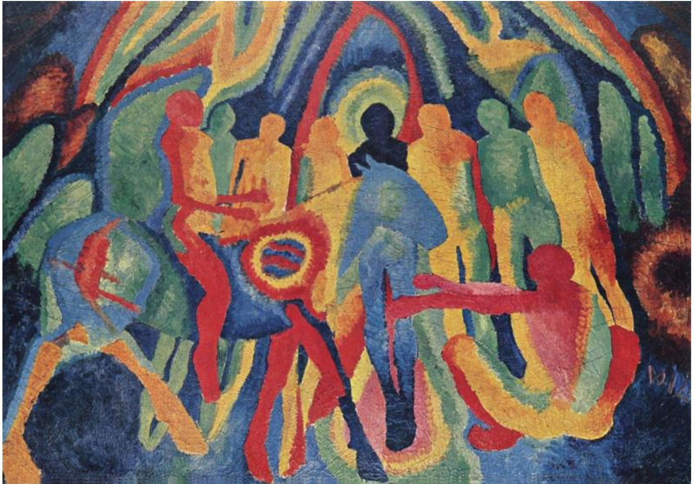
Morgner, Wilhelm, Entry of Christ into Jerusalem , 1912